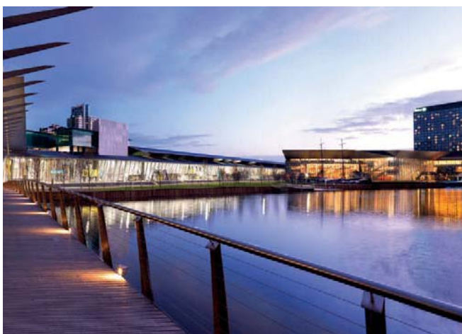
Images (top to bottom) Melbourne Convention Centre foyer Plenary The Melbourne Convention and Exhibition Centre